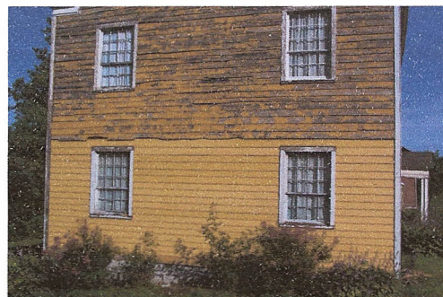
East end work in progress.

I personally want to compliment all of the above group of workmen who in most cases were subjected to my sometimes heavy handed bargaining and were willing to adjust their estimates to the point where we were able to afford all of the above. Very often I have felt overwhelmed and discouraged at all that still remains to be done on the building until I reflect on the