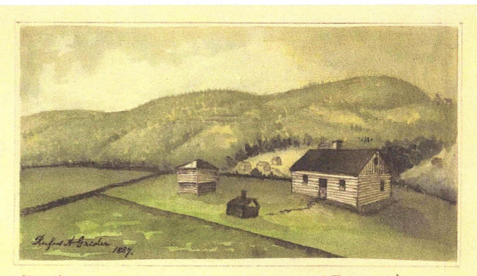
The NELLIS Form house & BLOCK house from lover St. Johnsville) was on the next farm W. of KLOCK'S where Johnson's Orrown halted for battle. The later JOLL GATE of the turnpike is seen on the hillside. Later any farm house was built firsther time the side of the public road & this one removal.